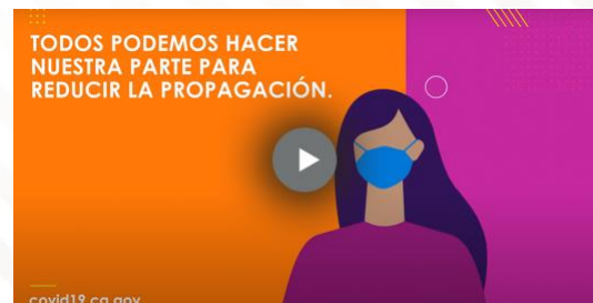
En California usamos mascarillas