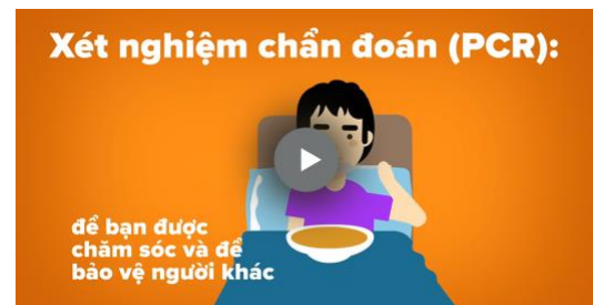
COVID-19 Testing 101: Vietnamese