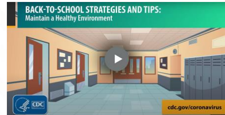
School Reopening with COVID-19: Maintain a Healthy Environment